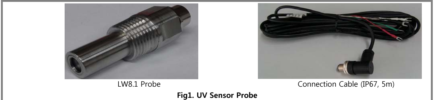
Fig1. UV Sensor Probe